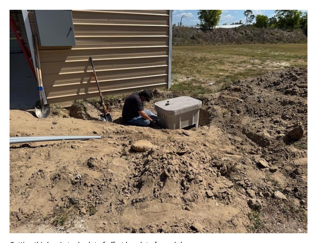
Getting this box in took a lot of effort by a lot of people!