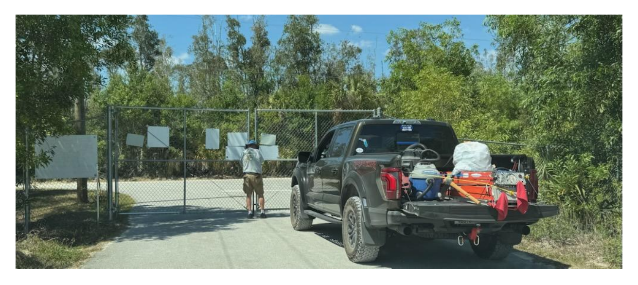
Larry packing up to leave as Day 1 was done!